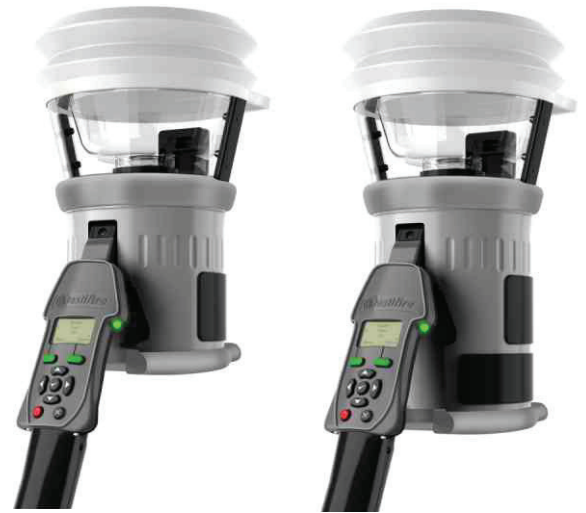
Testifire 1000 Smoke & Heat Testing